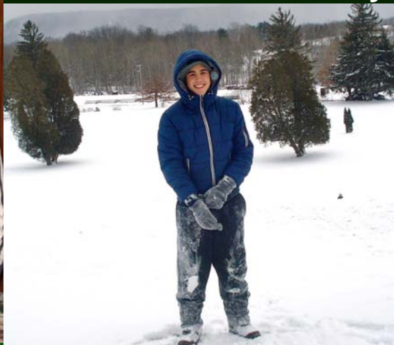
Playing in Snow