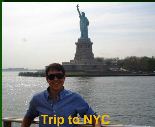
Trip to NYC