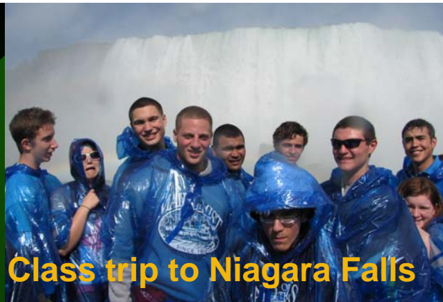
Class trip to Niagara Falls