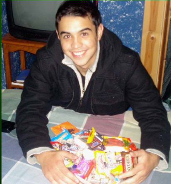
Hoard Halloween Candy