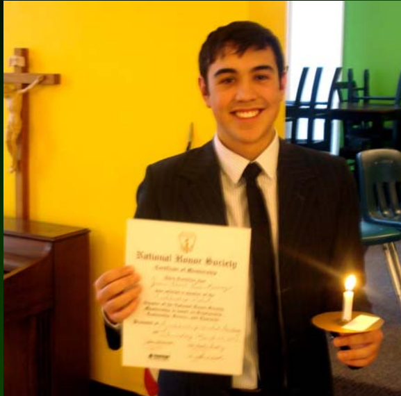
National Honor Society