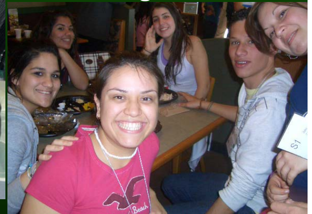
Hanging out with Friends