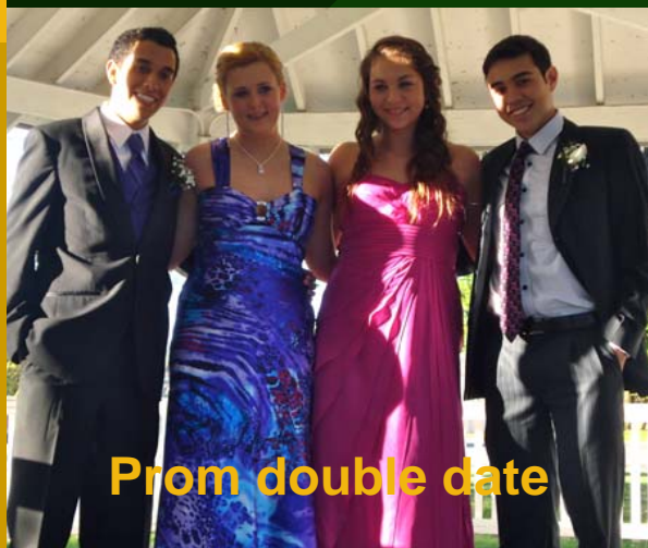
Prom double date