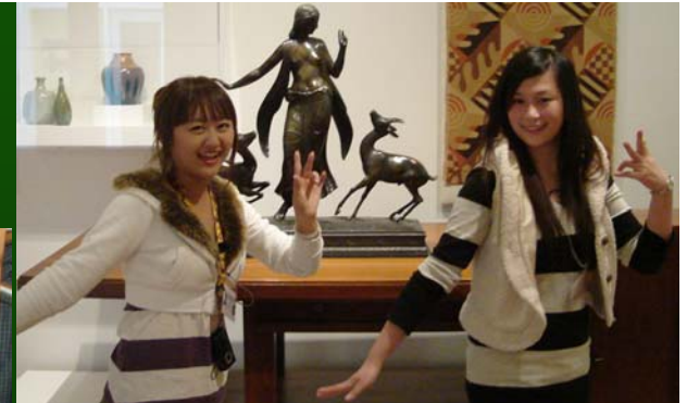
Touring a Museum