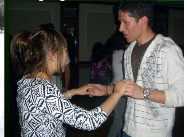
Dancing with the Stars